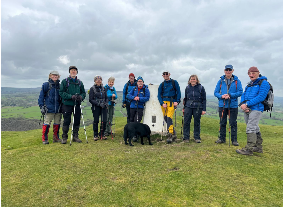
The team on top of Ecton Hill.