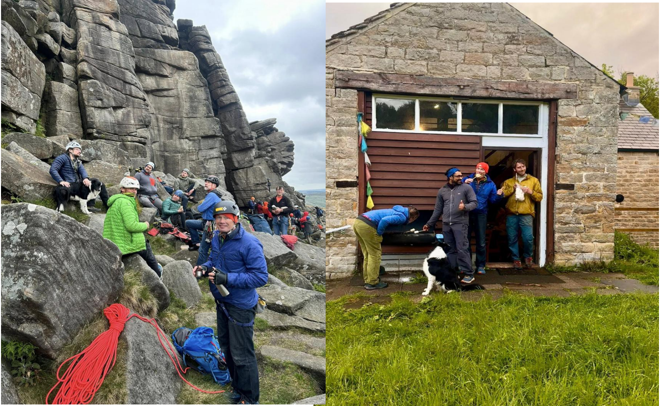
The New Members meet at Stanage and Heathy Lea.