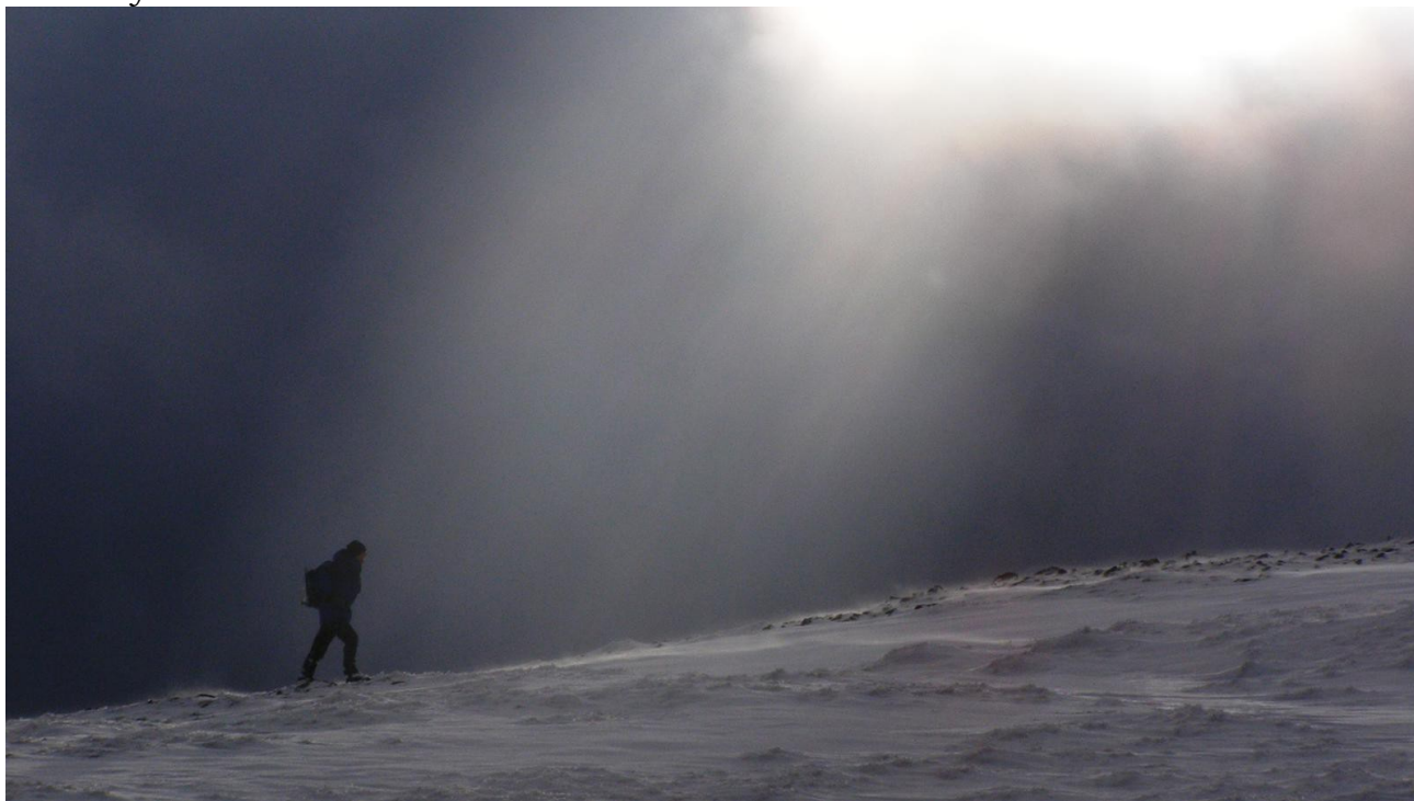
Tony Raphael striding up the wrong mountain.

The route description was very accurate, and I took one of my favourite photos (see below) of Tony striding purposefully up the wide soggy slope with poor visibility.