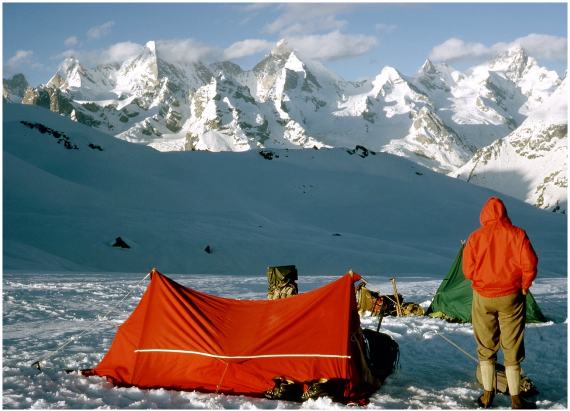
The great Himalaya divide between India and China (formerly Tibet) from the Tos Nullah, Punjab Himalaya, 1965