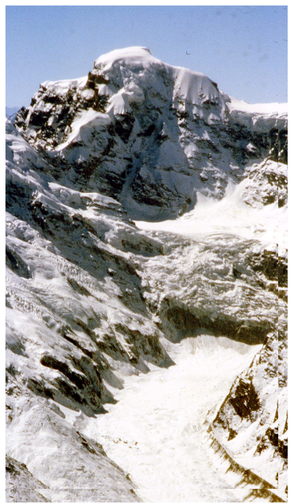
North face of Deo Tibba, 20,000 ft froma Cessna.