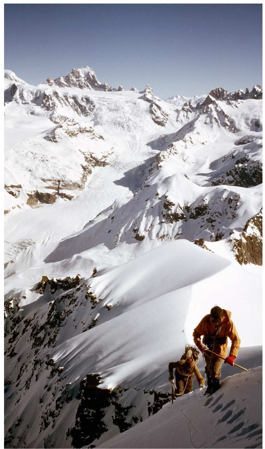
First ascent Ramhukor Peak, 18,000 ft Kulu.