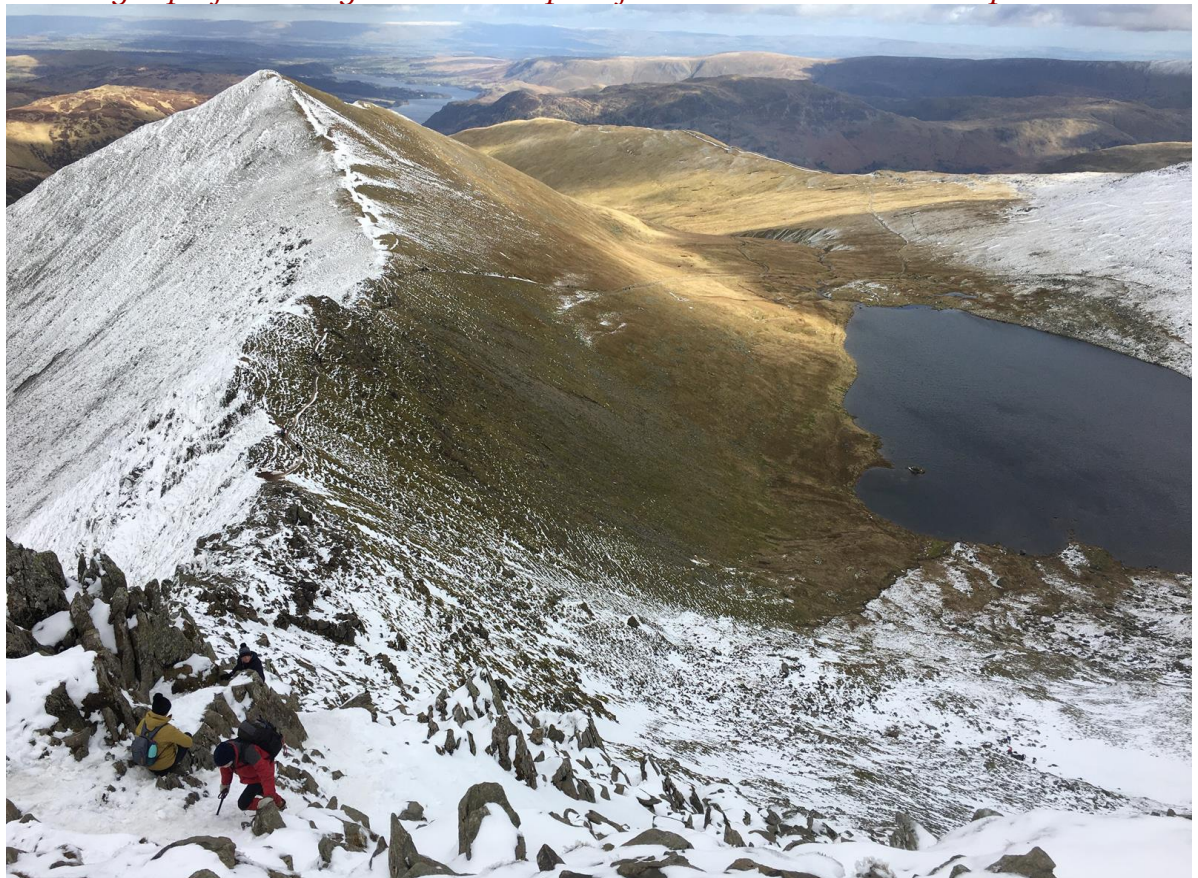
The Larkams were also up there, here on Swirral Edge. Photo Tom Larkam.