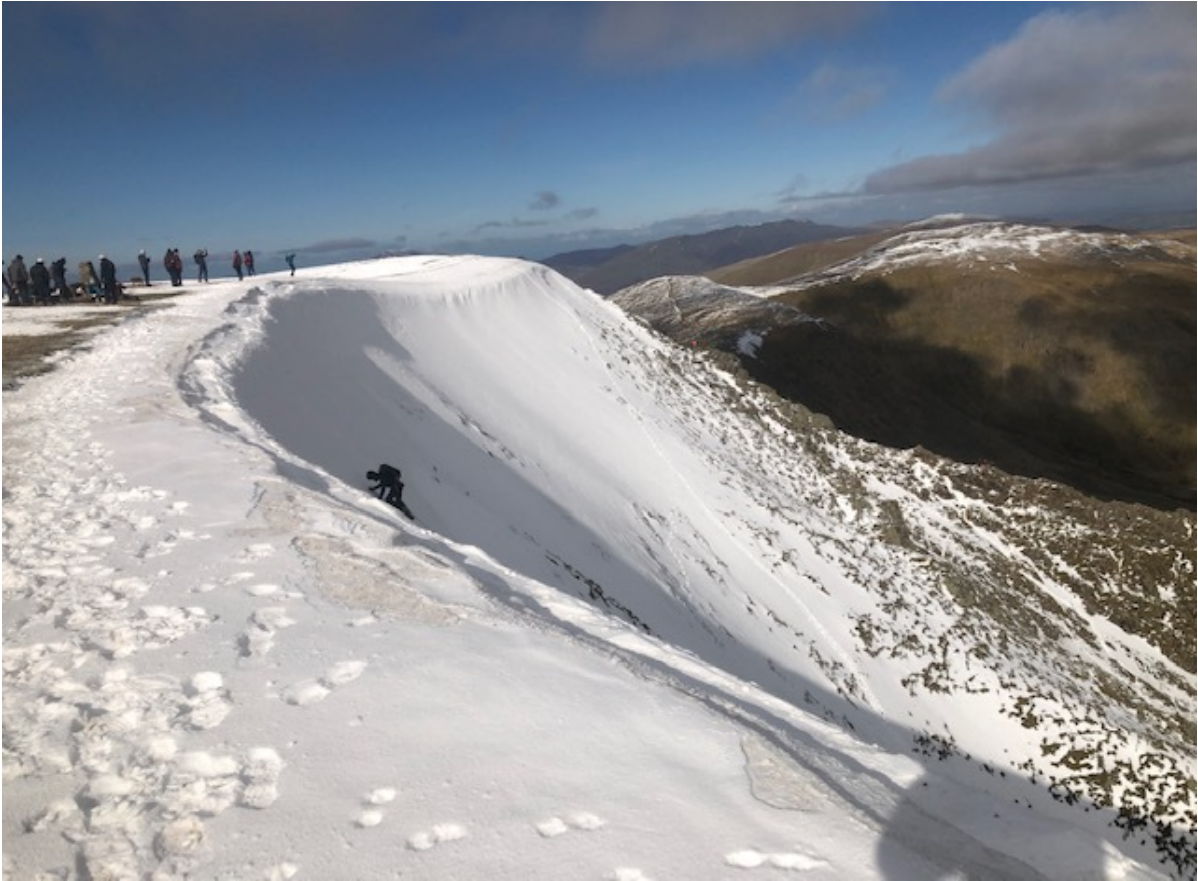
The snowy top of Helvellyn with a couple of ice climbers about to top out.