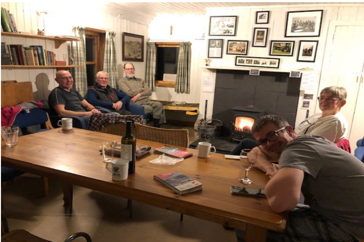
Inside Milehouse Cottage.