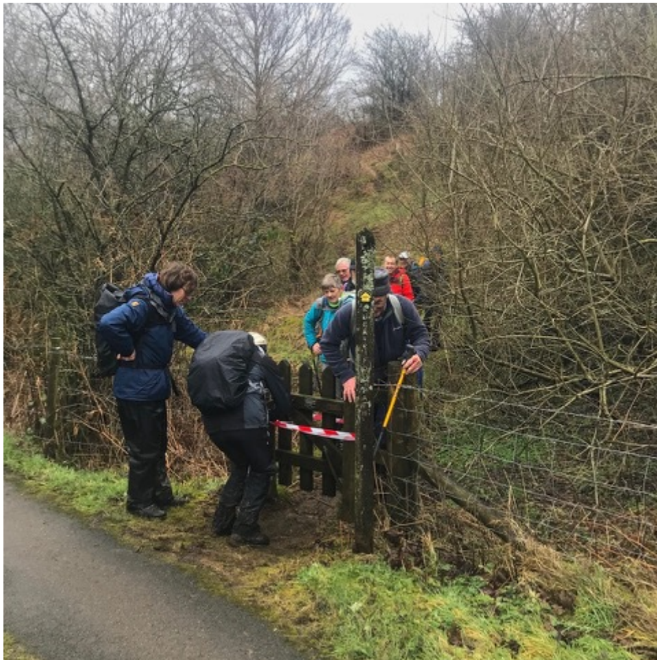
No barriers to Oreads.

The next section had us meander through the valley of Warslow Brook towards Upper Elkstone, this was so enjoyable that I led the group over parts of it twice. Following a food stop Mr Firth found yet another crossing of the brook for me, whereupon we wisely grouped upon a snapped bridge, the far side of which was gated and dressed with barrier tape to prevent use of the structure that we’d just crossed.