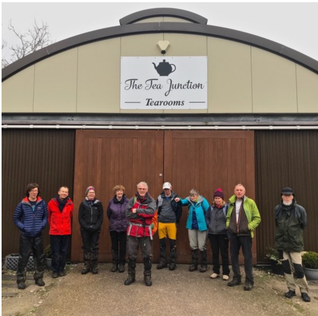
The Pointed Finger! Guilty as charged!