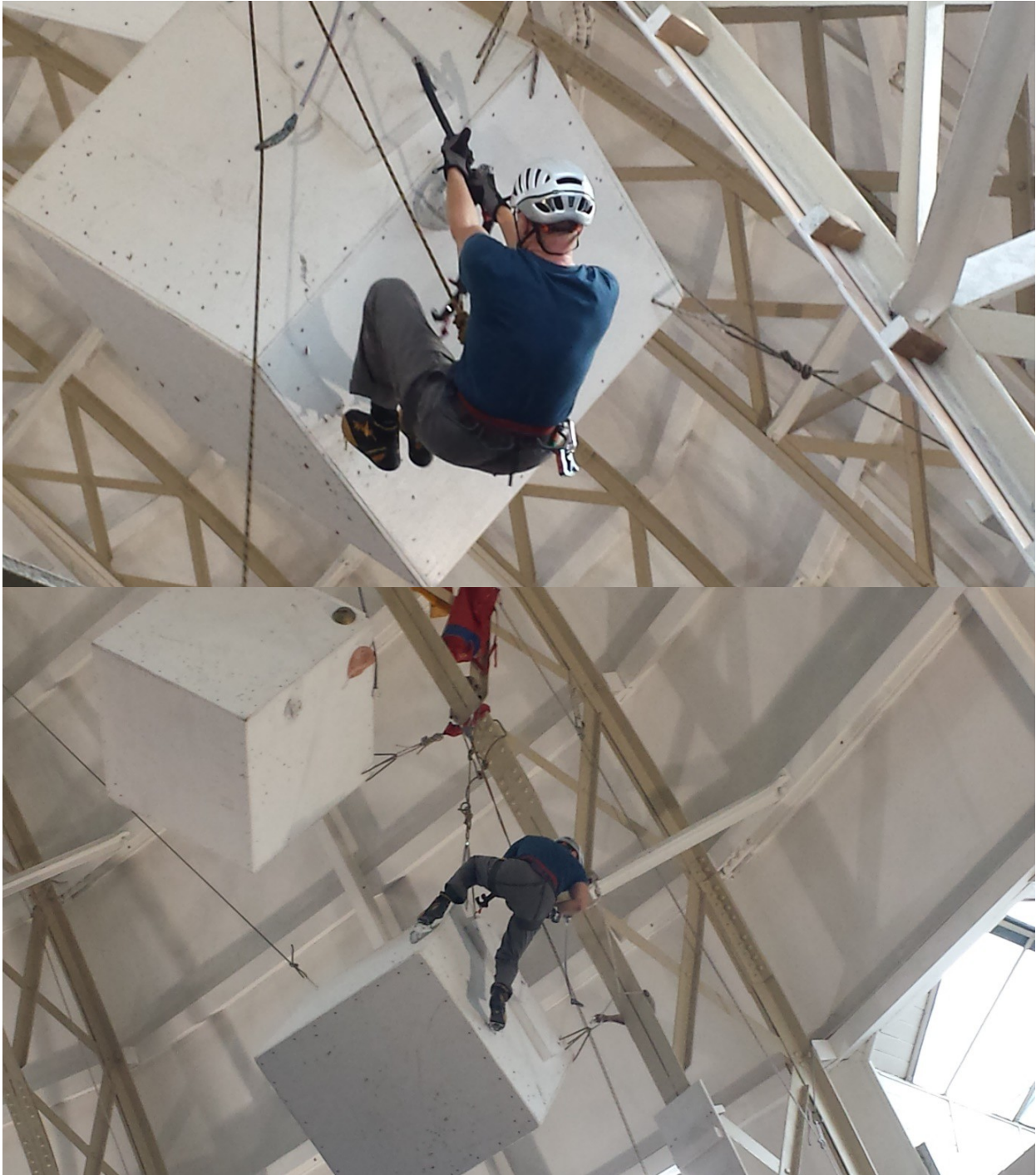
Cranking hard through the cubes

it, but my weight shifted and the cube moved under me. I watched as one of my Petzl Nomics dislodged itself from a hook and spun downwards towards the floor, landing softly in the net. I used my remaining tool to crank as high as I could, touch a highpoint hold, then relaxed. That ended my attempt and I jumped off. I'd only been climbing for a few minutes and I was really tired.