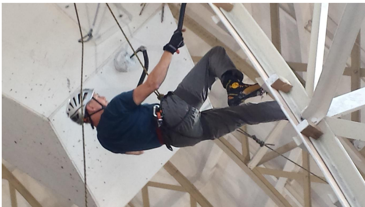
The start "ladder" leading to the first cube.

I did a couple of quick warm-up exercises then got myself ready at the base of the ladder, straightforward hooking but very steep. Then, two or three long reaches and a strenuous pull got me on top of the first cube. Wobble! The cubes were hanging from the steel work and moved in the air as you shifted your weight. I balanced across and got my picks into the second cube, then shuffled across towards the third. I had to take a hand off to make the next clip and got