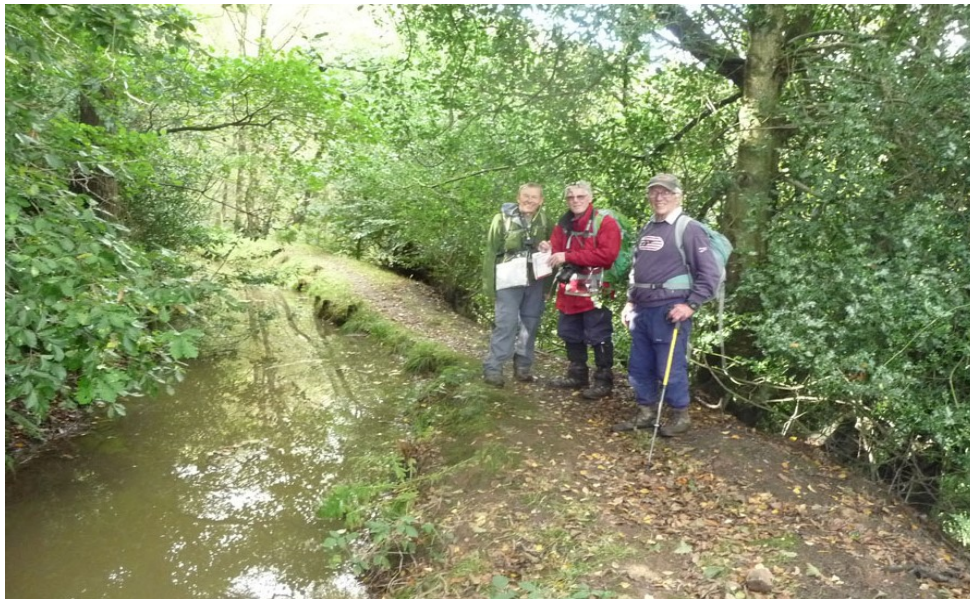
By the Conduit, above Farley Park.