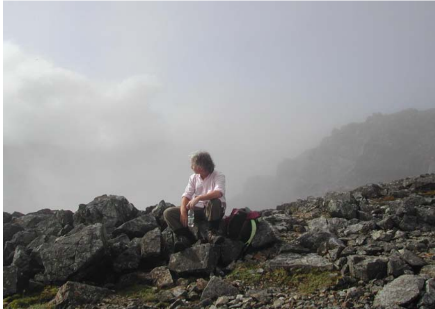
A mountaineer, (not one of the subjects of the puzzle), relaxing on the ridge.