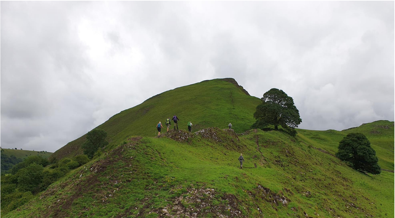
Socially distanced walking on the way to Chrome hill.