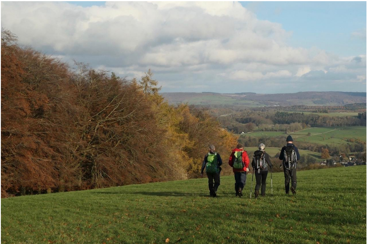
Wye Valley vista overlooking Ashford.