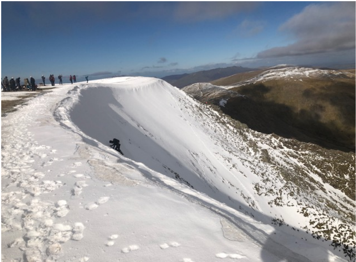
The snowy top of Helvellyn with a couple of ice climbers about to top out.