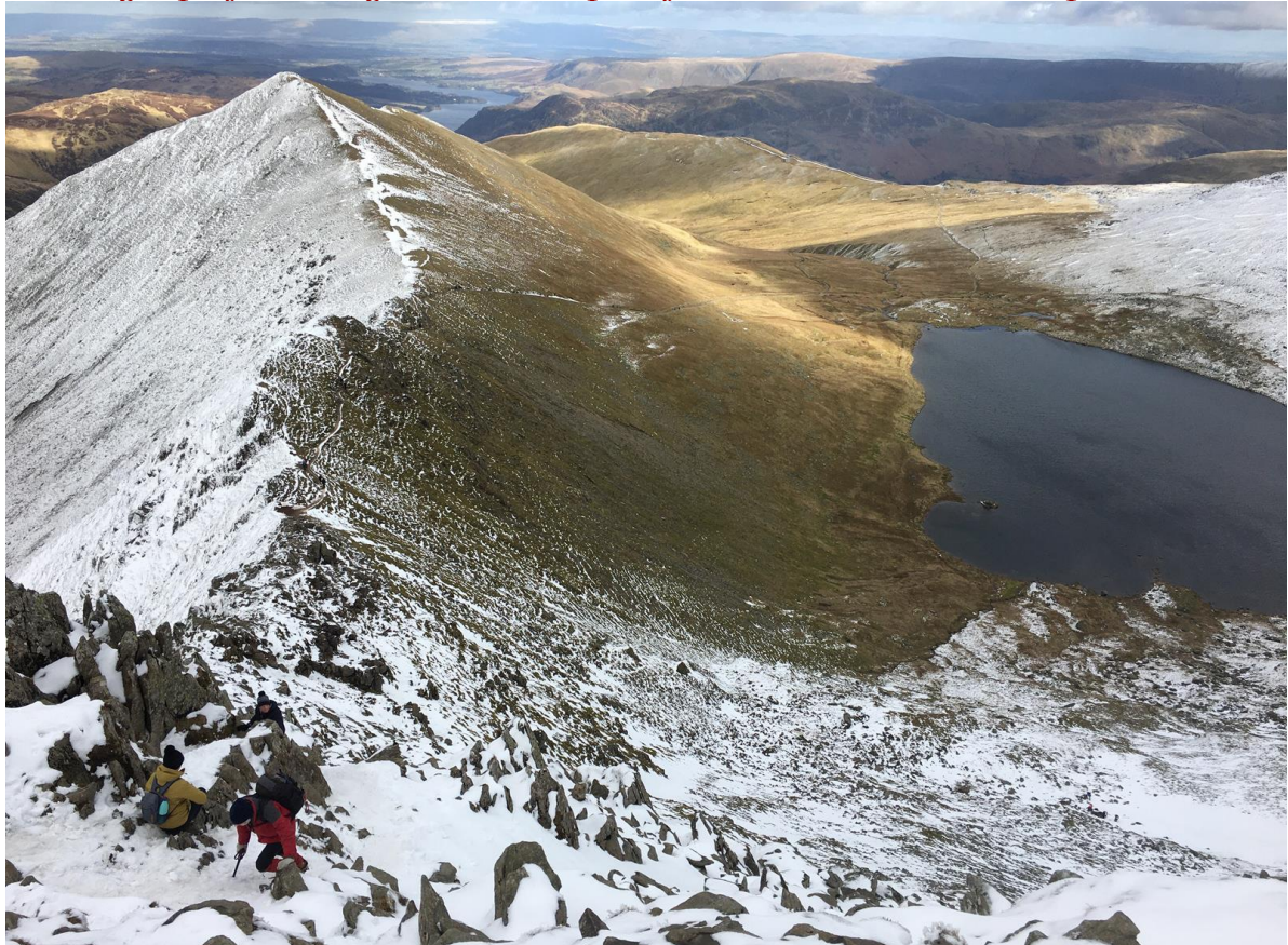
The Larkams were also up there, here on Swirral Edge.