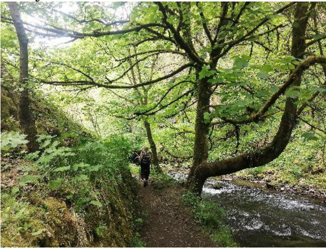
Along the Wye

After a brief stop we will head west past Shepley Farm and down Caxterway Lane (with a Medieval in-field system on our left) and on into Deep Dale with great views of Topley Pike Quarry. Crossing the A6 leaves us with a meander down the true left bank of the Wye, passing en-route the wonderous crags of Chee Dale. The path can be a bit slippery in the wet, but we shall have sunshine! Those wanting a faster/easier route can hop onto the Monsal Trail and rejoin us further downstream at Miller's Dale Station. A few metres along the road here takes us to the Anglers Rest and the potential of early refreshments. A final bit of uphill effort leads to the dilapidated Meadow Farm and brings the reward of a lovely walk downhill back to the start.