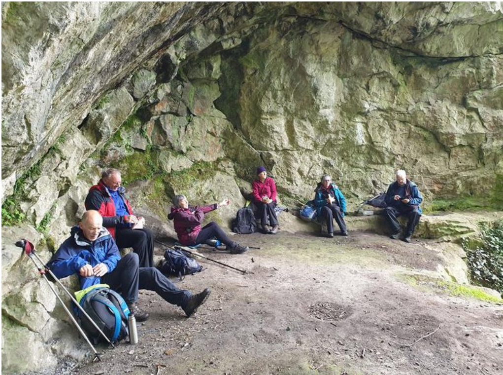
Lunch stop at the surprising Turkey Dip Rocks.

The Thursday walks have, so far attracted 15 Oreads and friends, most of whom have joined in more than once – a good sign I hope! The latest, around Winster,