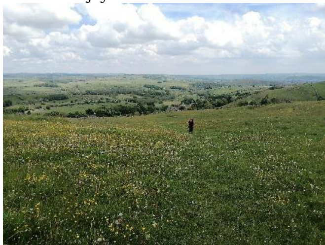
The wildflower meadows

We will amble a short distance down Tideswell Dale before taking a diversion to a basalt quarry whose stone was quarried for roads until the 1960's. It also affords good views. Back in the dale we pass the junction with Millers Dale and reach Litton Mill where we cross the river above the notorious mill and head fairly steeply uphill, crossing the Monsal Trail. The wild flower meadows we cross are a joy to behold when in bloom and alive with orchids.