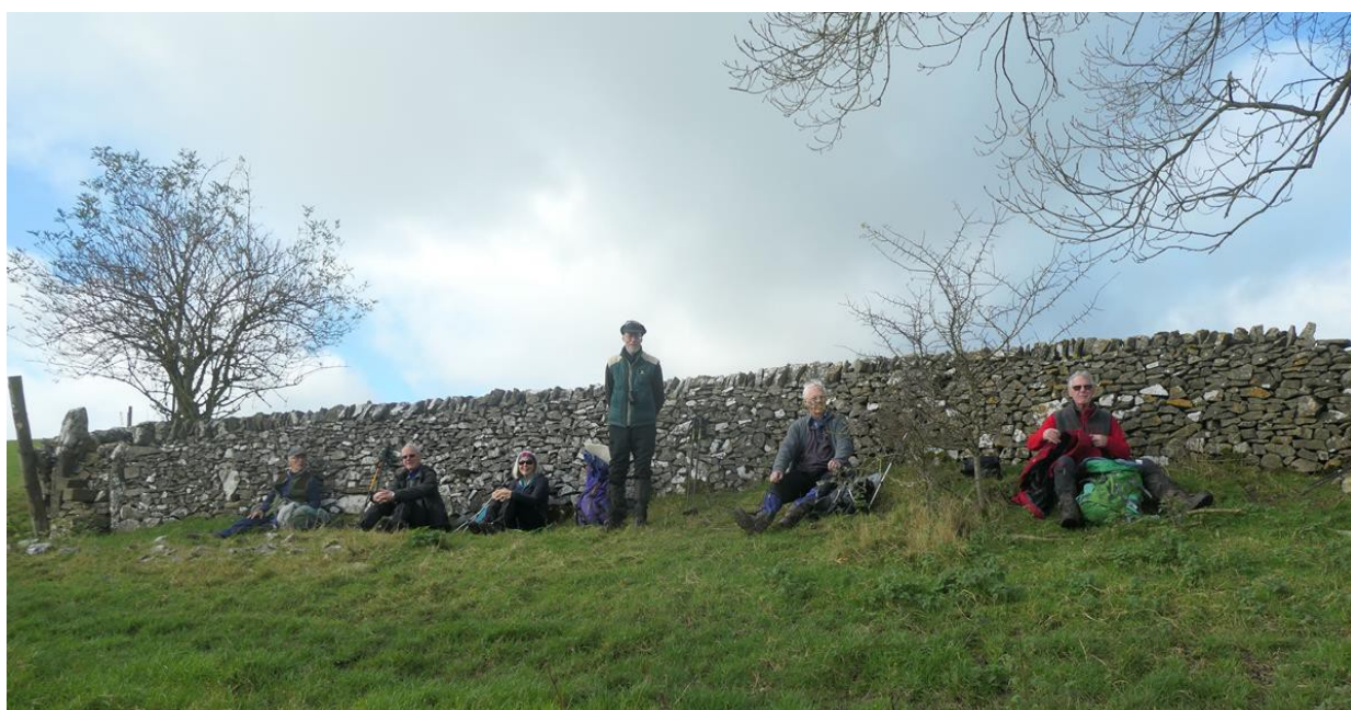
Lunch stop.