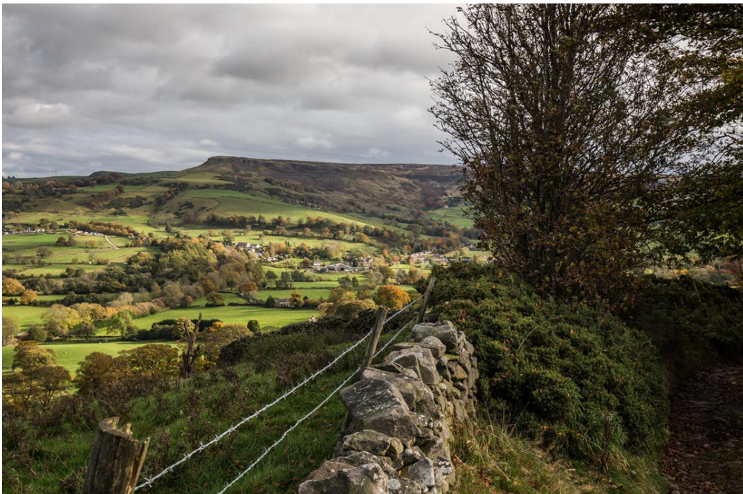
View from Long Lane under the shadow of Ladder Hill.

very dark, threatening clouds. The immediate rain risk didn't materialise, and I left Whaley by signs of old rail lines and wharfs in the direction of Combs Reservoir, passing through the farmsteads of Cadster and Tunstead. At the latter I made a navigational mistake and found myself fighting my way up a steep, heavily vegetated gully, which I persisted with to eventually receive patchwork shadowed views of Whaley in the one direction, and the pennine moorlands in the other. The penalty had not been too costly, I accessed the contouring Long Lane about a quarter of a mile off target.