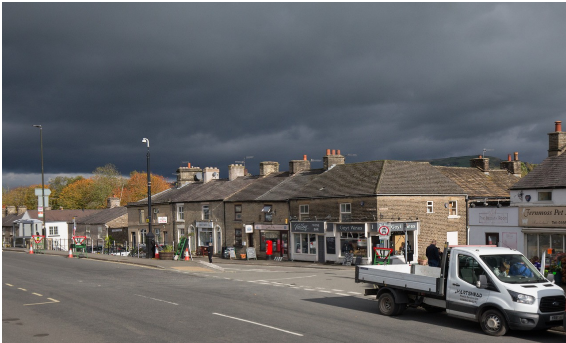
Threatening rain: mid-point lunch stop by Whaley Bridge Station.

very dark, threatening clouds. The immediate rain risk didn't materialise, and I left Whaley by signs of old rail lines and wharfs in the direction of Combs Reservoir, passing through the farmsteads of Cadster and Tunstead. At the latter I made a navigational mistake and found myself fighting my way up a steep, heavily vegetated gully, which I persisted with to eventually receive patchwork shadowed views of Whaley in the one direction, and the pennine moorlands in the other. The penalty had not been too costly, I accessed the contouring Long Lane about a quarter of a mile off target.