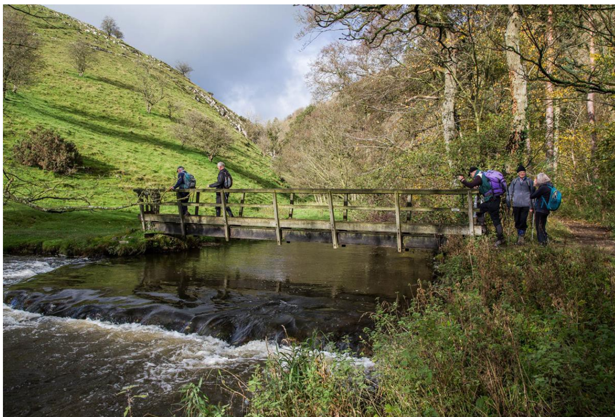
Coldeaton Bridge heading out of Wolfscote Dale towards Alstonefield.