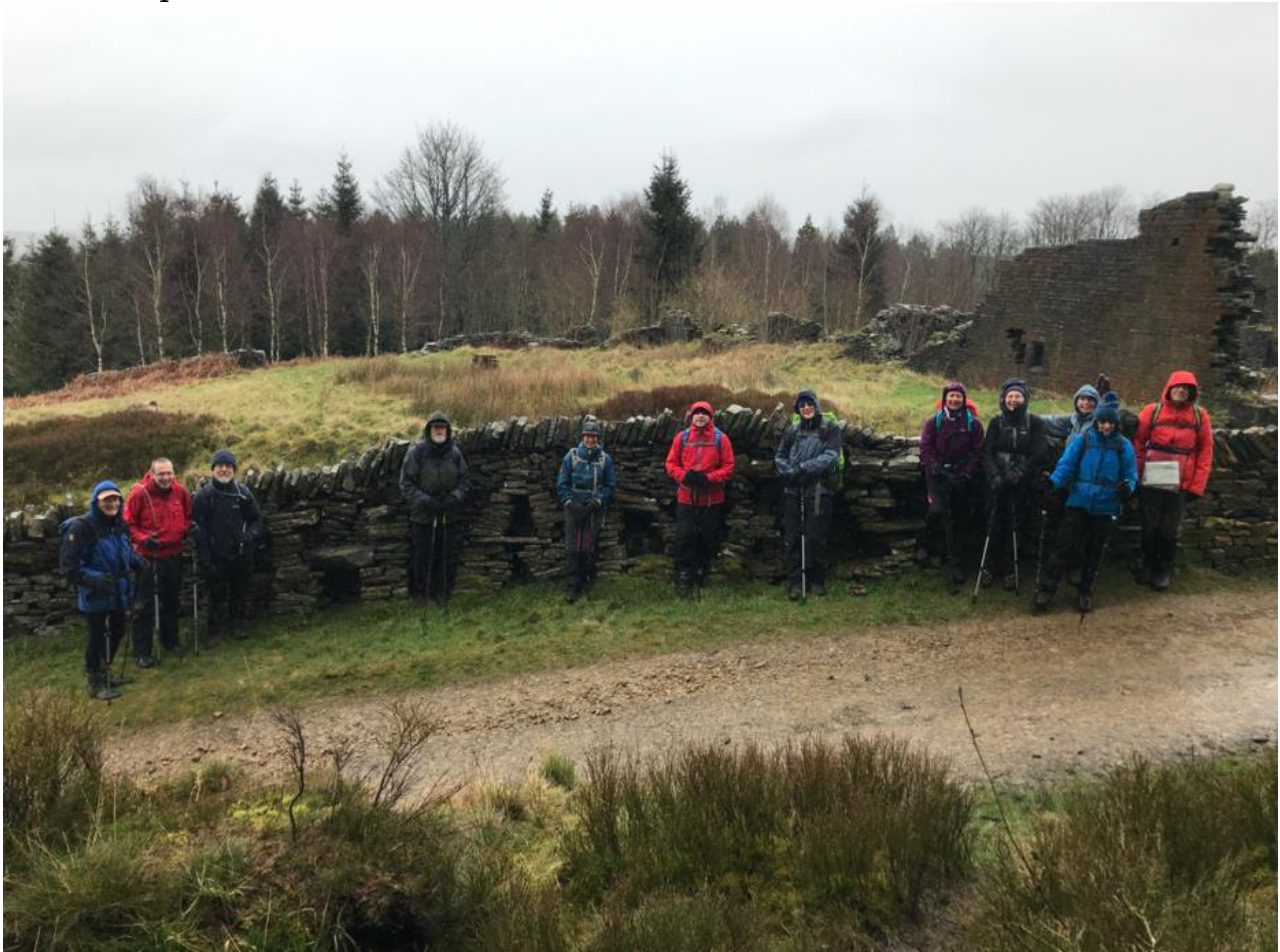
Hades – a fine piece of graphic drystone wall demarcates the official entrance to Hell.

Our second day seemed colder and we passed through interesting woodland from Heaven (Elysium Farm) to Hell (Hades). Not surprisingly, the weather then warmed up.