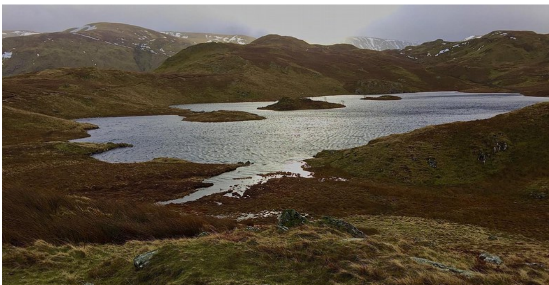
Heading towards High Street via Angle Tarn - later driven down to Hayeswater and Brotherswater to miss the stinging hail.