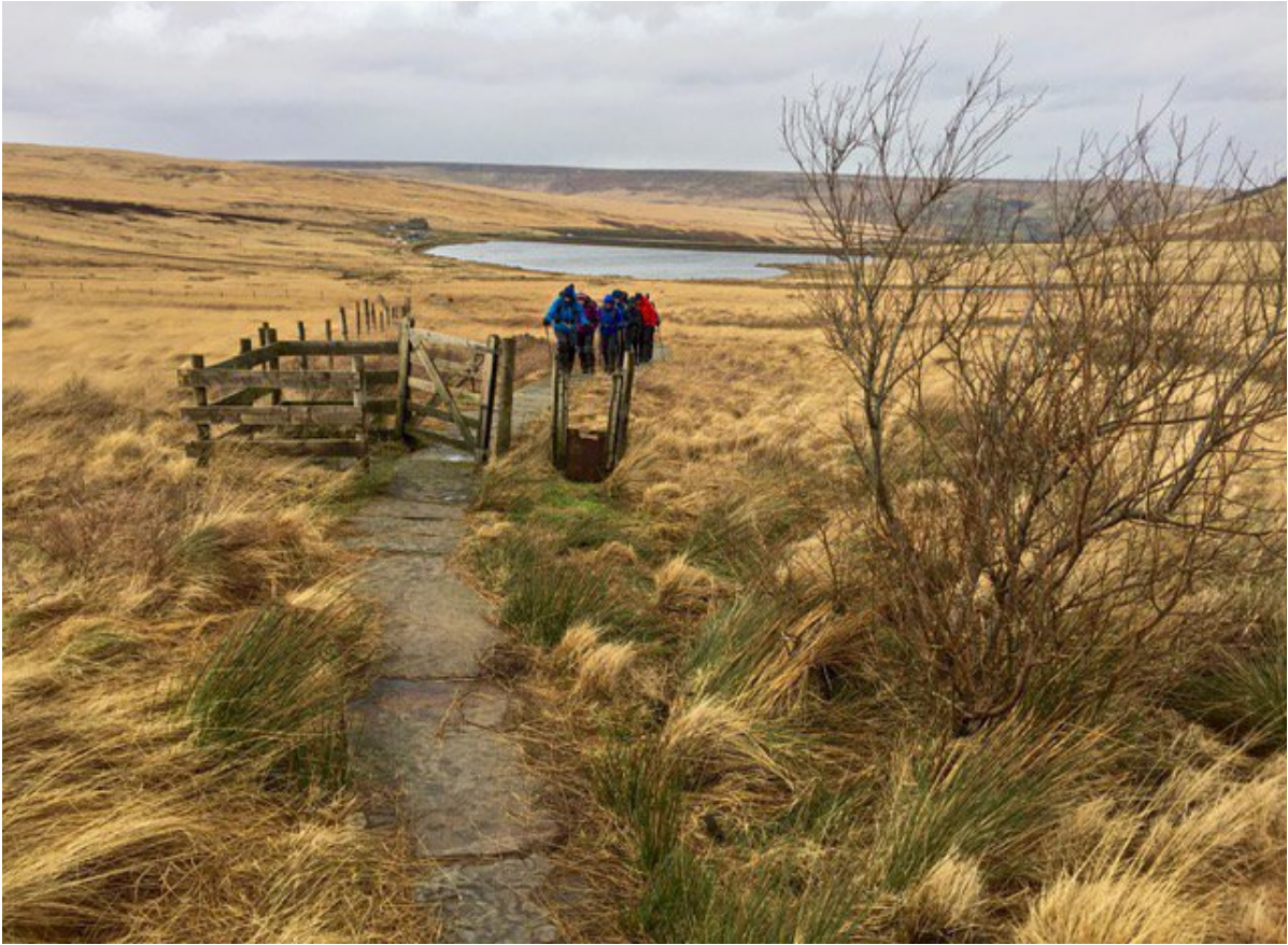
Heading south on the Pennine Way towards Redbrook Reservoir.