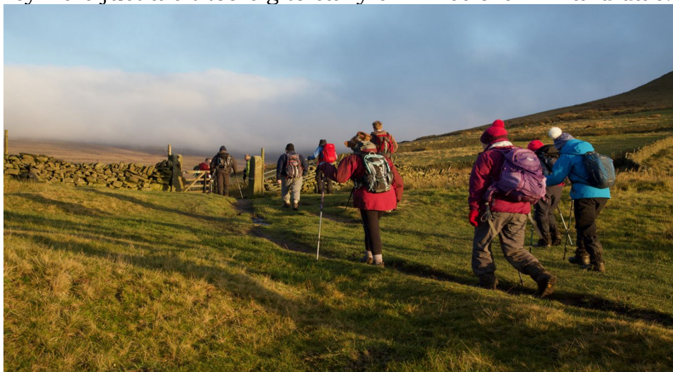
Contact made with the Pennine Bridleway before South Head.