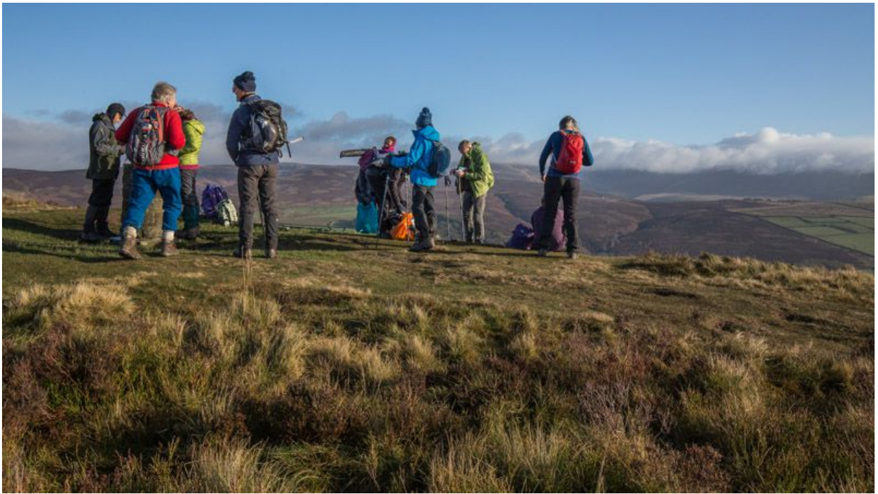
Stunning views from Lantern Pike.

Manor Park stream afforded a boot wash facility, which was greatly appreciated and the sun was still shining. A great day out.