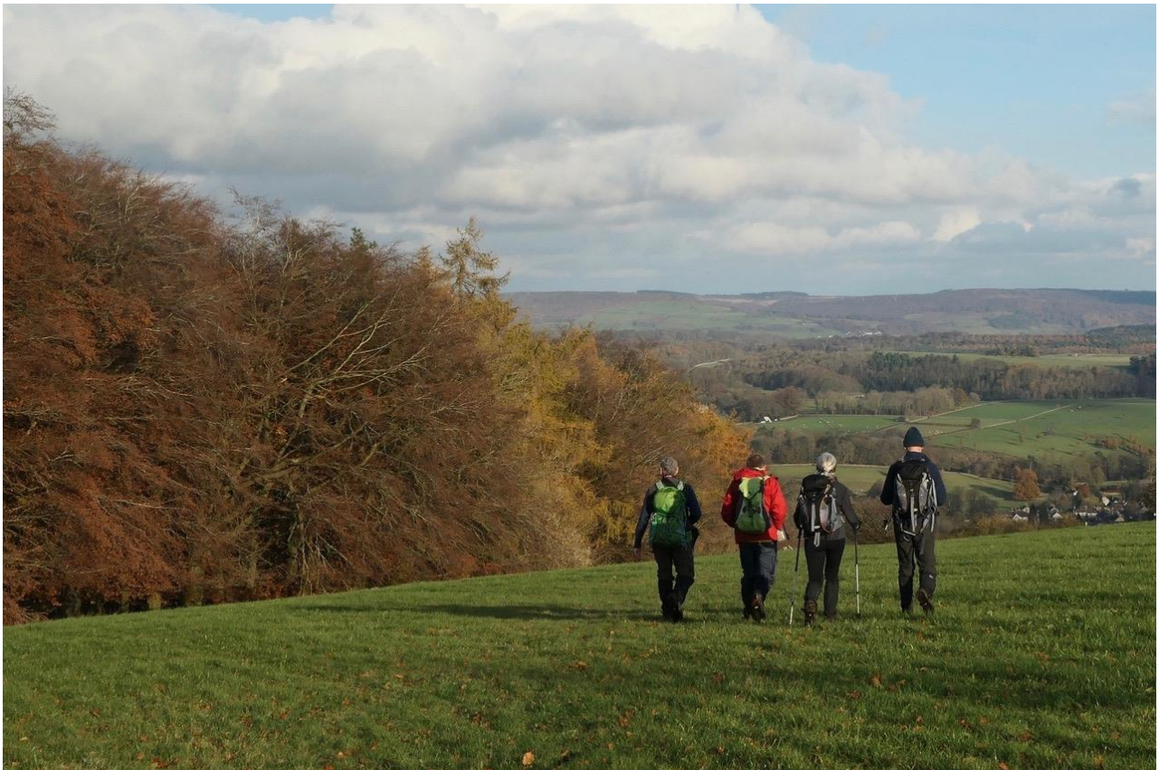
Wye Valley vista overlooking Ashford.