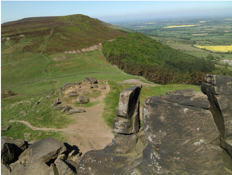
The view from the Wainstones.

The campsite is BUNGDALE HEAD FARM CAMPSITE, at Scawton, Nr Helmsley, North Yorkshire, YO7 2HH. Tel 01439 770589. It's on the Cleveland Way. It is a small quiet site on a working family farm, in a peaceful location with magnificent views across the countryside. The charge for a motor home/campervan with two adults without hook-up is £15 per night with a reduction for just one adult. For tents the charge is £6.50 per person per night. Electric hook up points are £3.50 per night. Facilities include: level and well drained pitches, electric hook-up points, chemical disposal point, toilet block with h&c water, wash basins, washing up facilities. It is a small camp site that is reluctant to take family groups because of problems with late night noise and drinking by people sitting around in groups late into the night. We have a field to ourselves. www.bungdaleheadcamping.co.uk