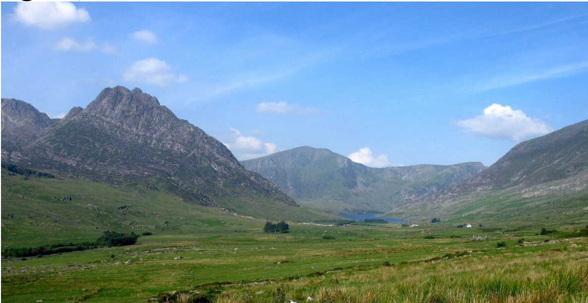
The Ogwen Valley, Tryfan and Y Garn seen from below Carreg Mianog.