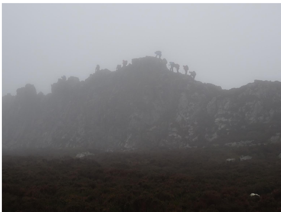
Having fun on the Stiperstones.