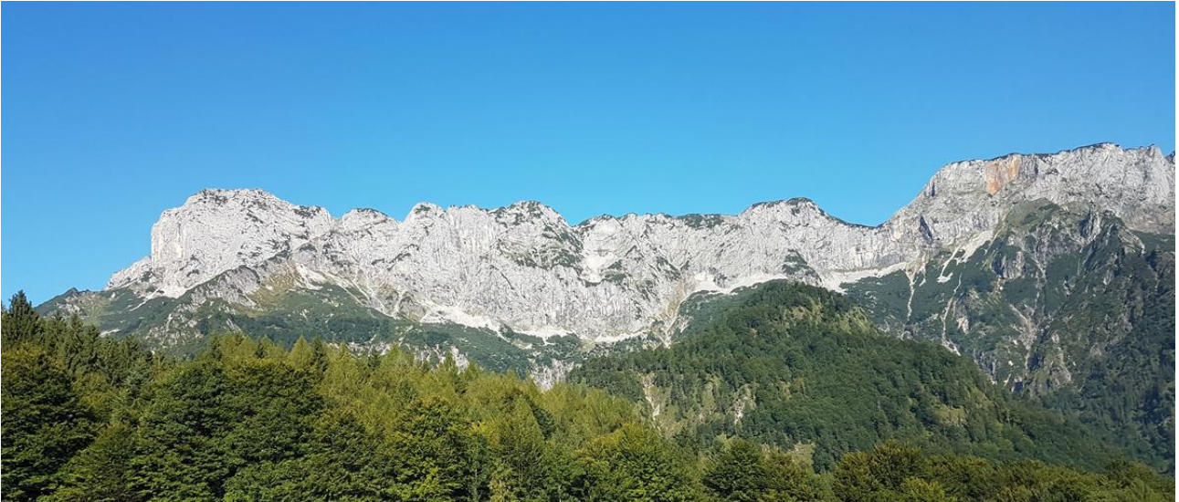
The Berchtesgaden Hochthronsteig