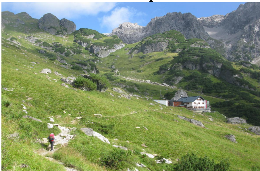
The Muttekopf Hutte in its spectacular setting.