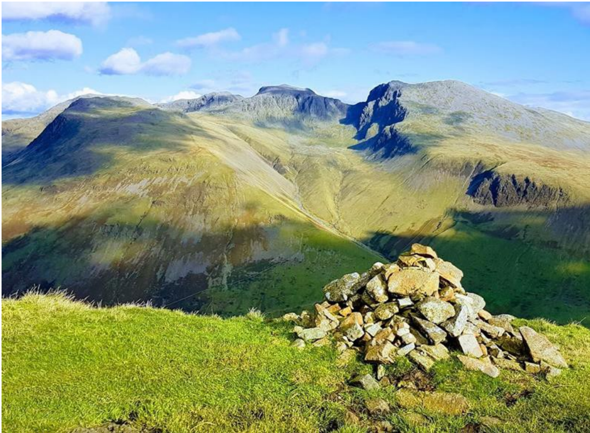
The Scafell group from Yewbarrow

The FRCC Brackenclouse hut is in a superb position with unrivalled views overlooking Wasdale. This weekend we were blessed with fine weather so could enjoy excellent autumnal conditions in “the birthplace of British rock climbing”.