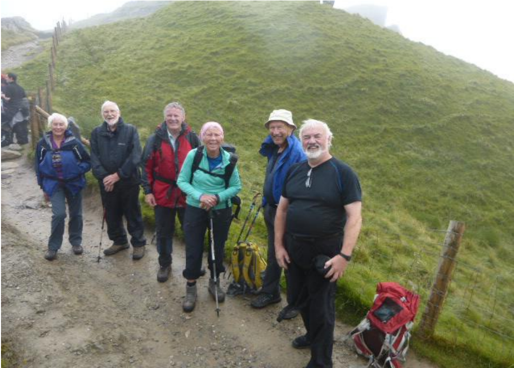
Part of the motley crew en route for Snowdon