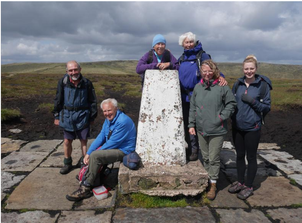
The team on top of Brown Knoll

The previous week in Wales the Apprentice suggested Rushup Edge as a basis for the next Monday Walk. I say ‘Apprentice’ because he only has a paltry 55 years’ experience of mountain walking and a minute knowledge of Peak District paths