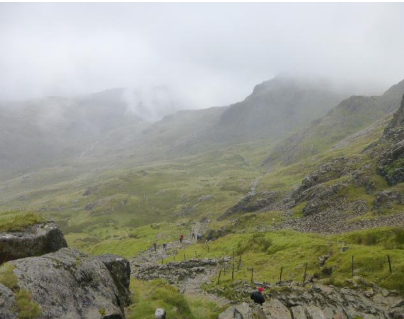
The Pyg track on a misty August morning.