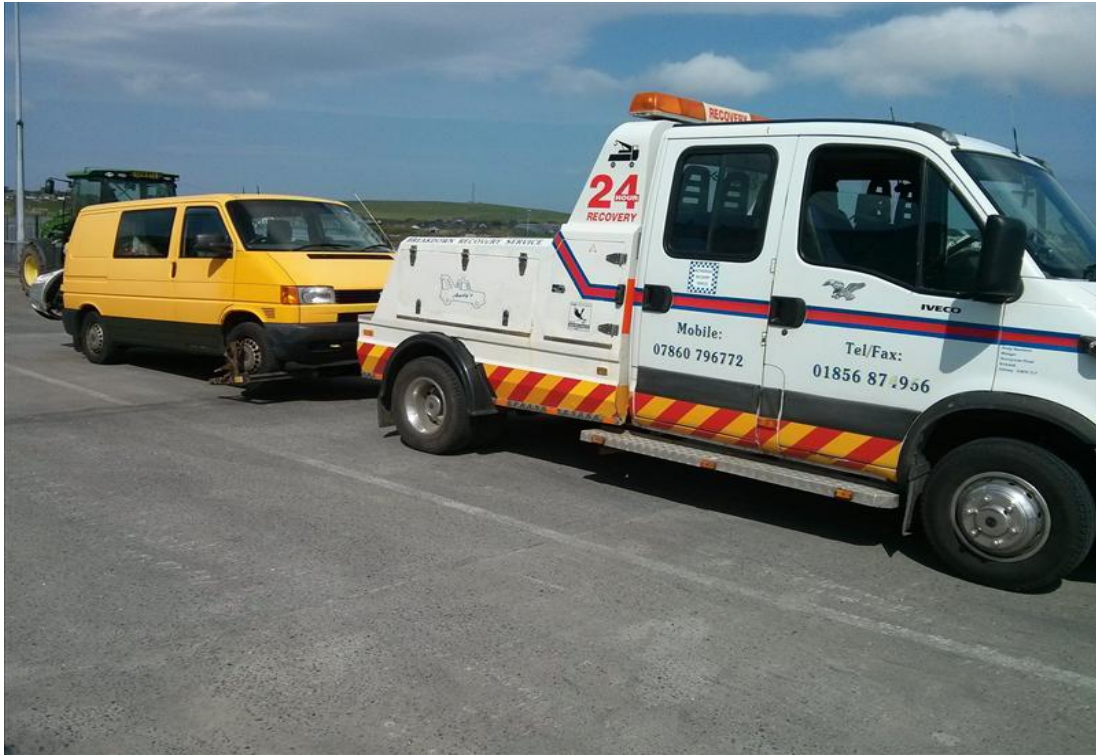
The Lancastre steed with one of its many rescuers.

The group learned the lesson of many great warriors and vowed to return when they had placated their Gods and repaired their chariots. One day the Old Man will succumb to the might of the noble Northern Lords.