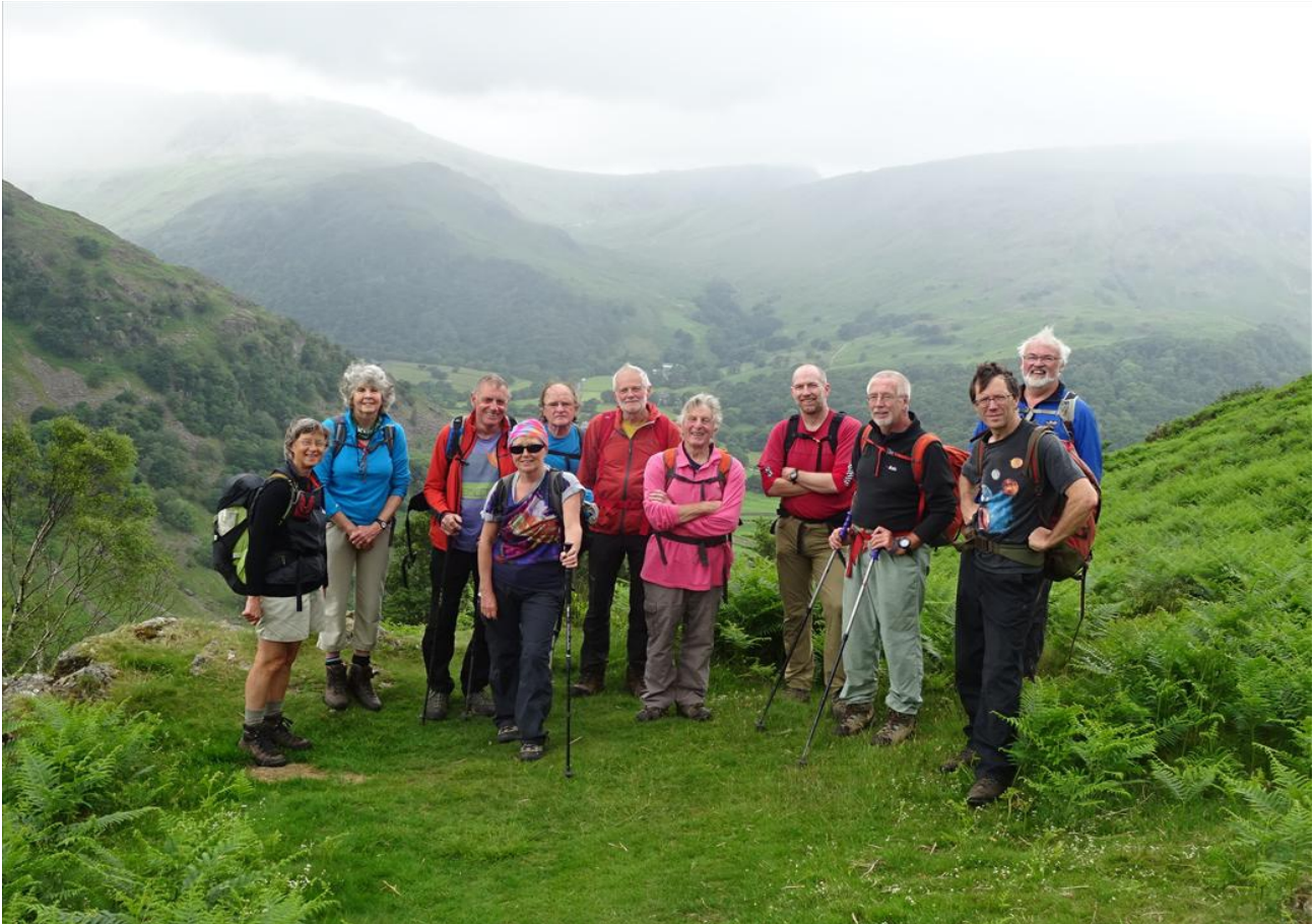
The Watendlath team heading for tea and cakes (how decadent!) on the Sunday of the High House meet.