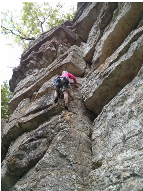
Pink on limestone

In 2014 to team colour was PINK. What will you be wearing this July?