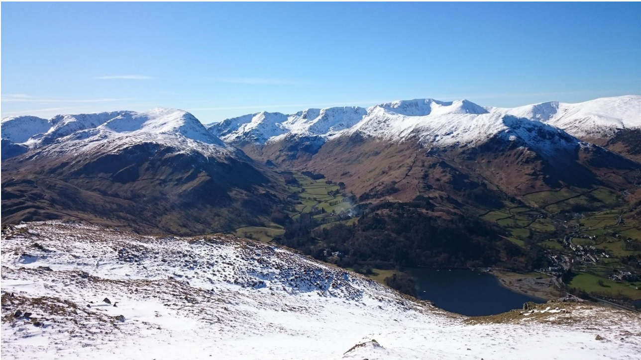
Stunning conditions on the Sunday of the Patterdale meet.