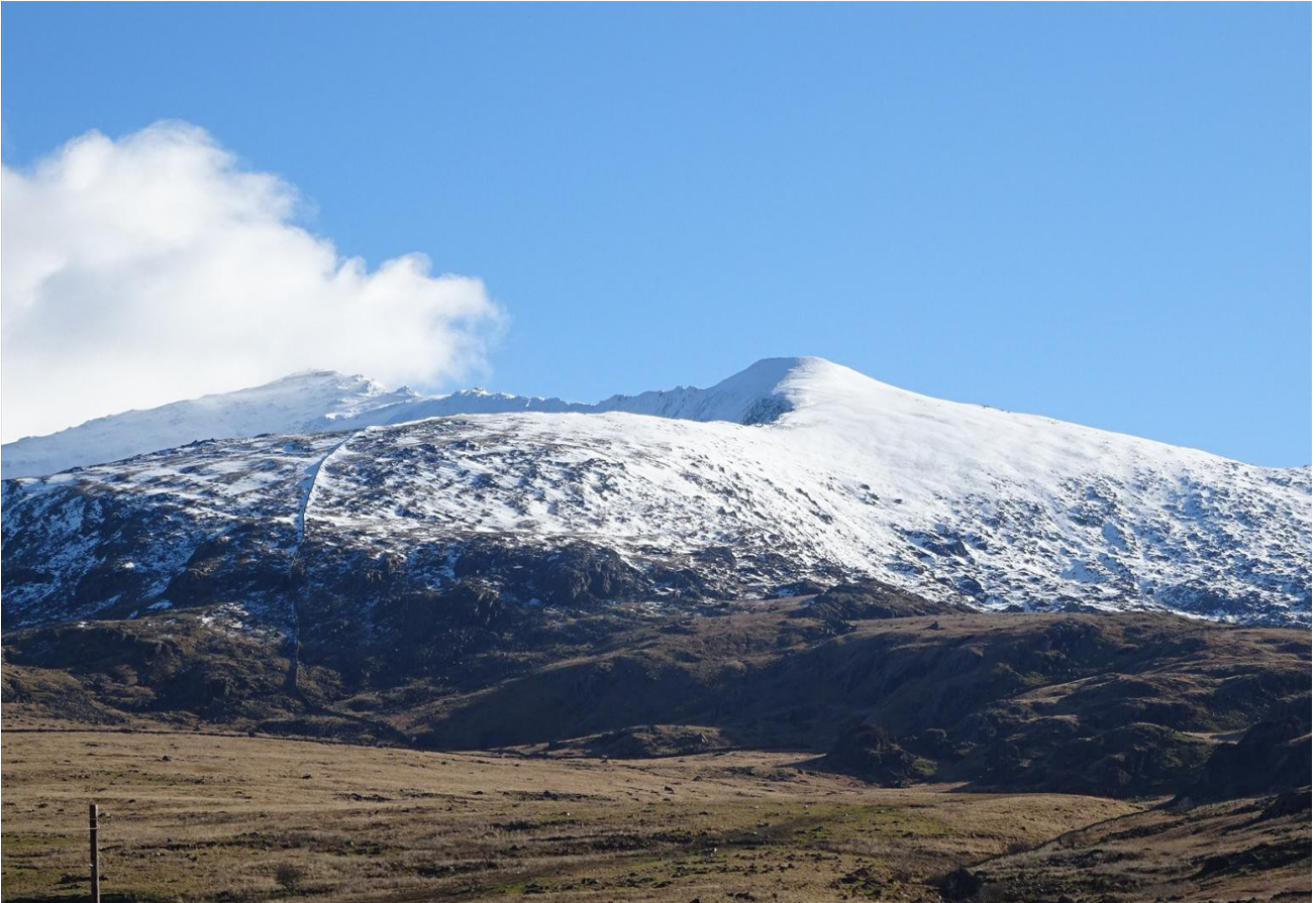
Snowdon from Tan yr Wyddfa - looking positively alpine on 10 March.