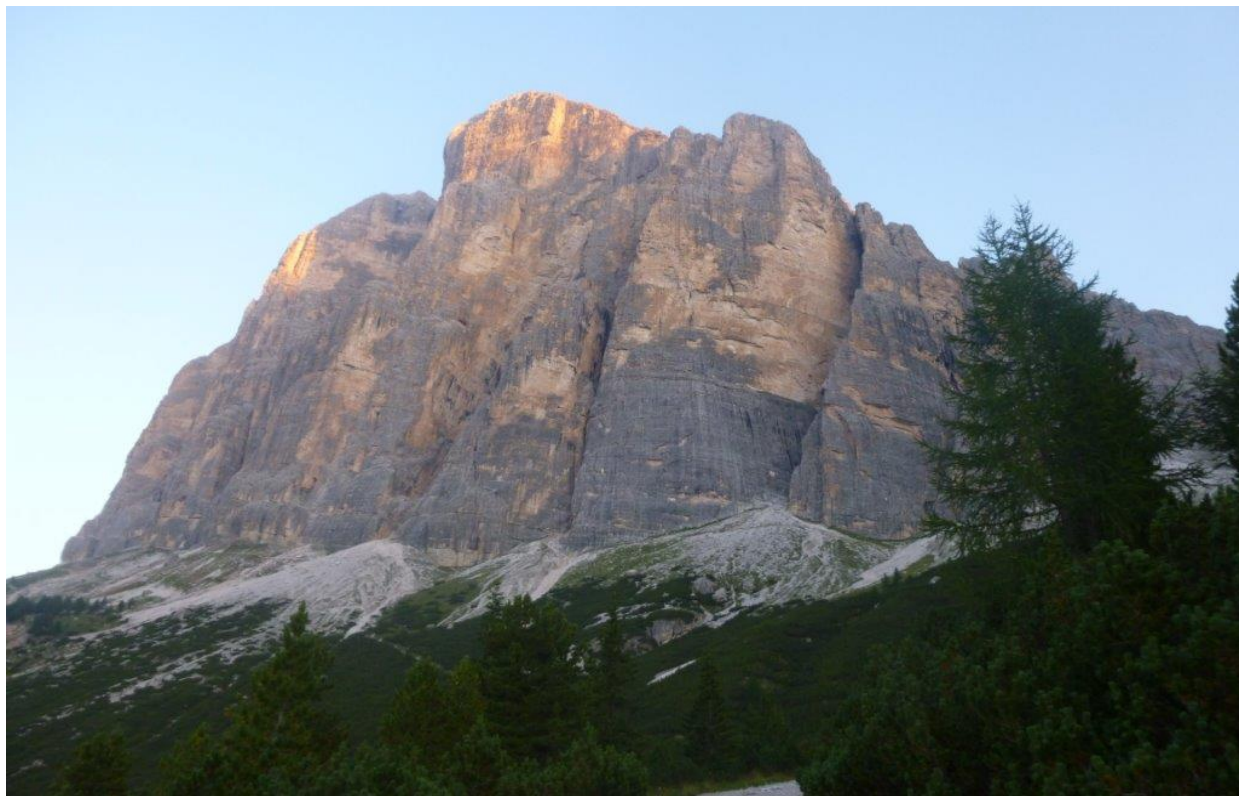
The Tofana di Rozes

We weren't even supposed to be doing the "Pilastro". Our warm up on Via Paolo Rodela, VIII, on Punta Fiammes hadn't quite gone according to plan, we'd encountered poor rock and spaced gear, so we had traversed off onto the much more pleasant classic Via Dimai, IV+. It had been a good day out, but not the big challenge we'd hoped for. As we free wheeled the bikes back to Cortina from Punta Fiammes I wondered what was next.