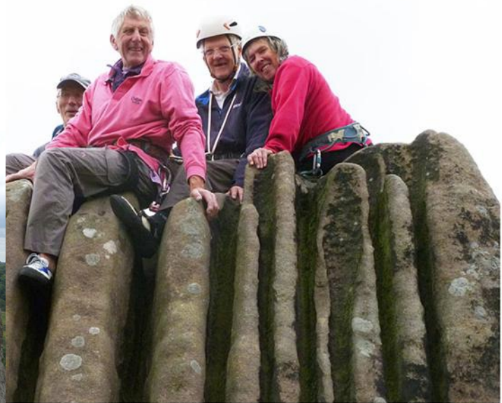
Weasel Pinnacle "The team"