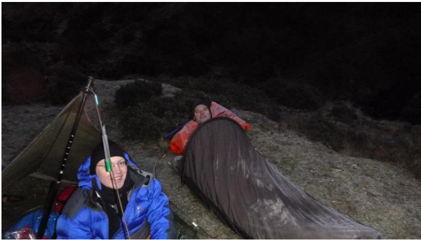
Sunrise, -5am on the Howgills and still smiling. It must be the beer from the night before.

On her early morning walk with the hounds a local lady was astounded to find “people sleeping on the hill”. So much so that she told everyone she met of the strange phenomenon. Sadly her