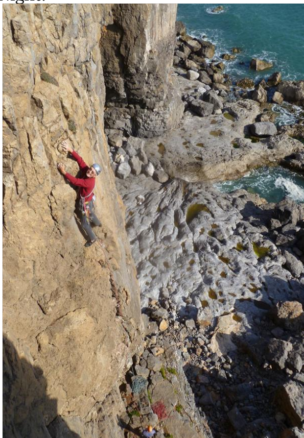
Chris Radcliffe on The Loosener. St Govans.