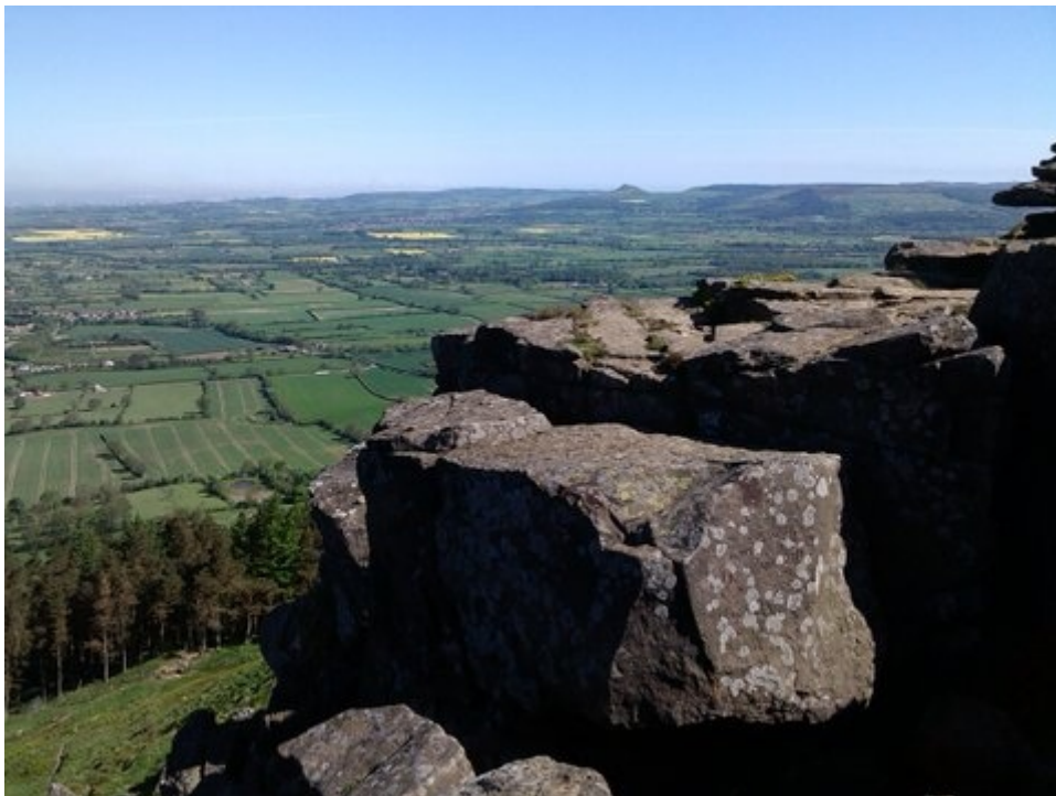
View from the Wainstones towards Roseberry Topping.