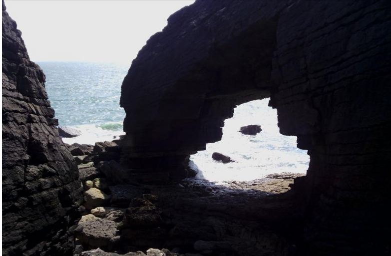
Stunning rock architecture at Arch Zawn, Range West.

More details of this meet in next month's issue but if you want to climb on Range West and have not attended one of the official briefings you will need to do so. This year's final briefing date is 26th July. It will start promptly at 9am and will be at the Castlemartin Army Camp as usual.