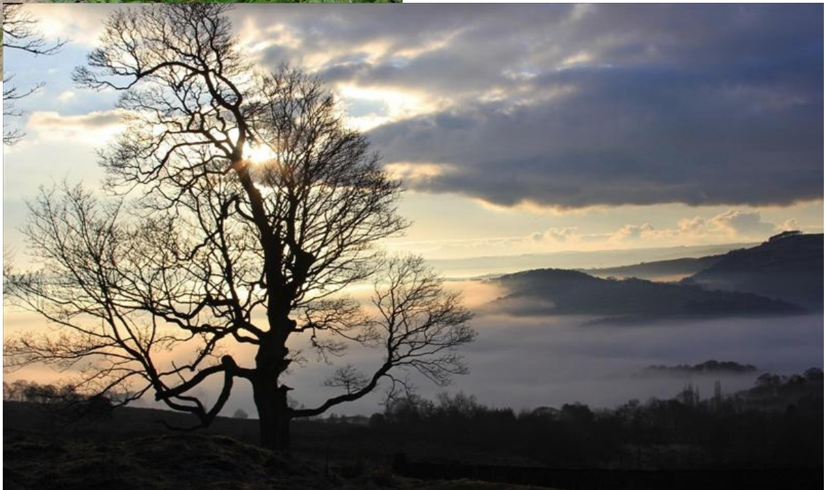
Below: End of a perfect Peak District day. 20 th January at Curbar Gap.