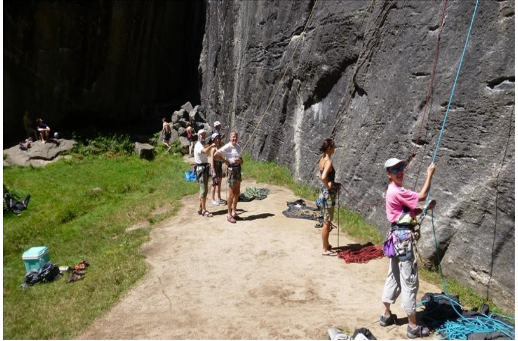
At the Giant Boulder, Val di Mello.