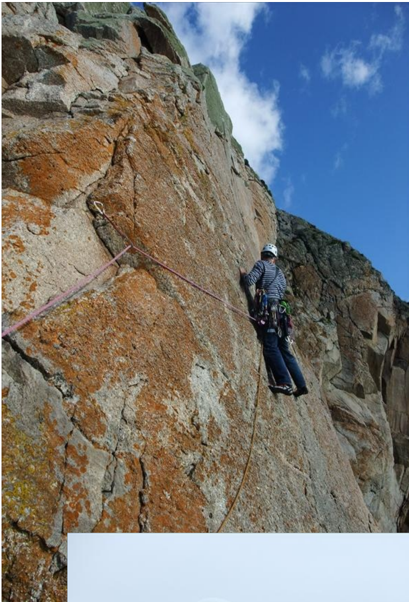
Pete Lancaster warming up on Diamond Solitaire. Lundy. September.