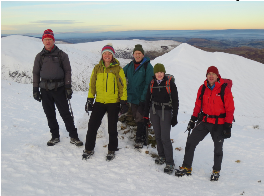
Last year's happy party on top of Helvellyn