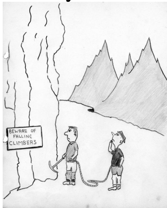
The Val di Mello remains a stronghold of trad ethics.