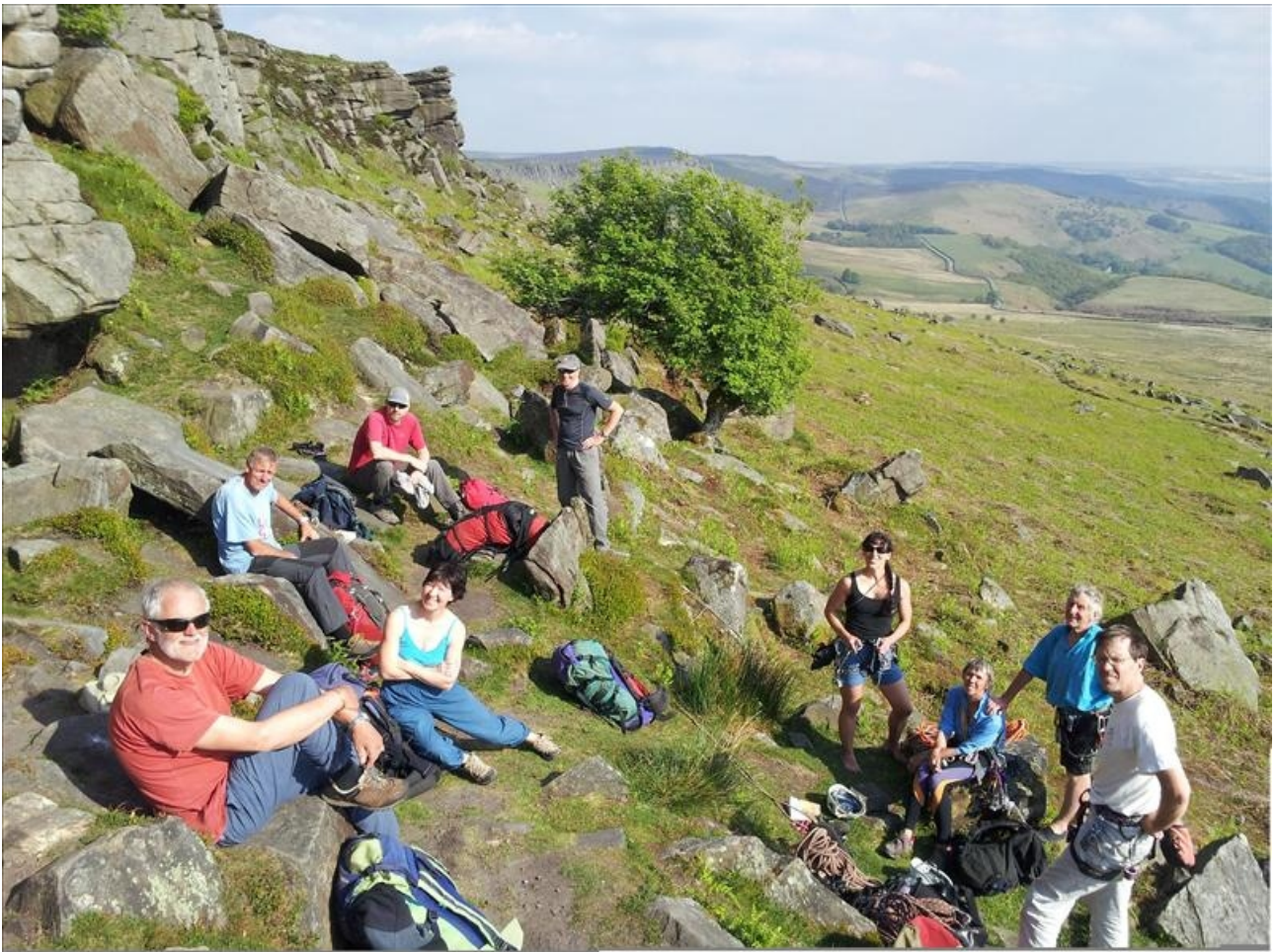
A good turnout on an amazingly hot Sunday at Stanage.