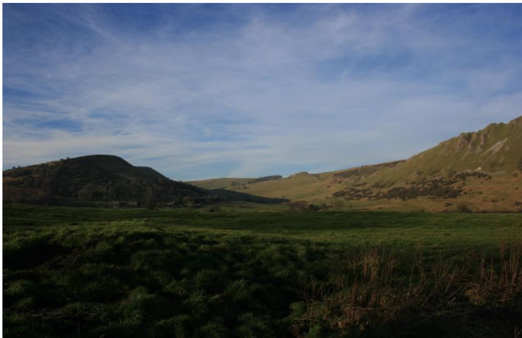
Hollins Hill viewed from the Dove.