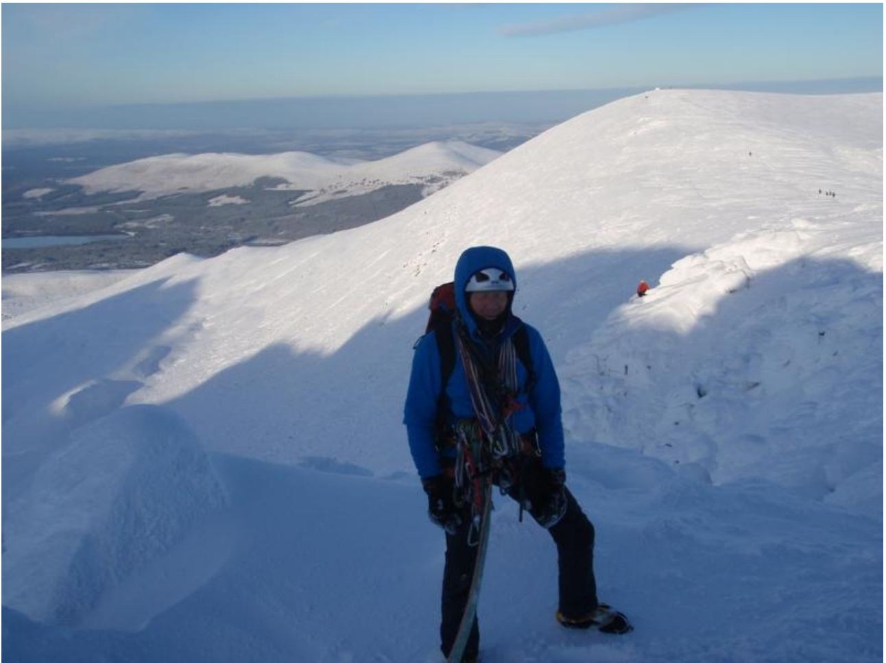
Good weather at the top of Hidden Chimney, with Loch Morlich, Glenmore and Point 1131 behind.