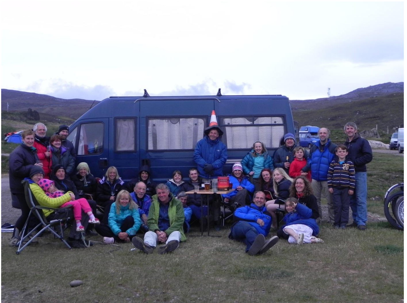
Nearly all of the Reiff Rogue meet 2012 attendance.