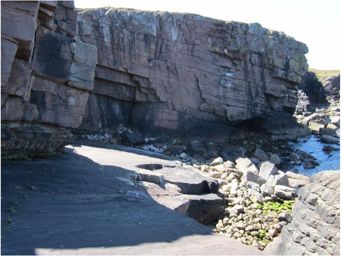
Roger and Dave enjoying "Spaced out Rockers on the Road to Oblivion" E4 5c,5c.

"Roll up roll up, for the ultimate alpha male contest! For one night only, the Middleton Ox versus the Southwell Silver back....." This will be one of the many memories I will treasure from the Reiff Rogue meet 2012. Most of you will agree that seeing almost 30 Oread and their families smiling and laughing over the course of the week safely constitutes a successful meet! The campsite was perfect. The weather was very kind with a predominant easterly wind keeping away the dreaded midge and no precipitation to write home about. Porpoise, seals, otters, golden eagles and osprey were amongst the plethora of wildlife spotted throughout the trip.