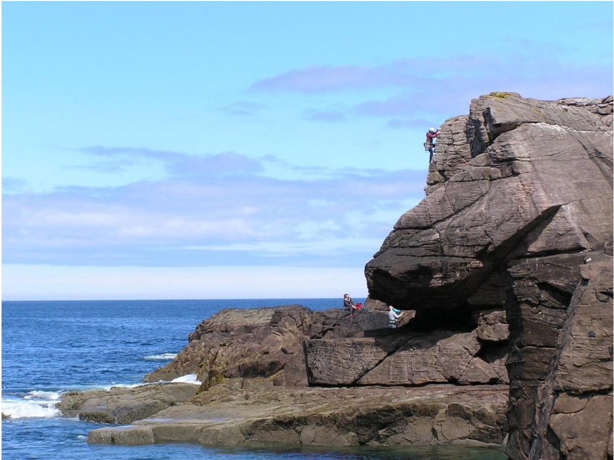
Victoria balancing up “Hy Brasil” Vs 4c