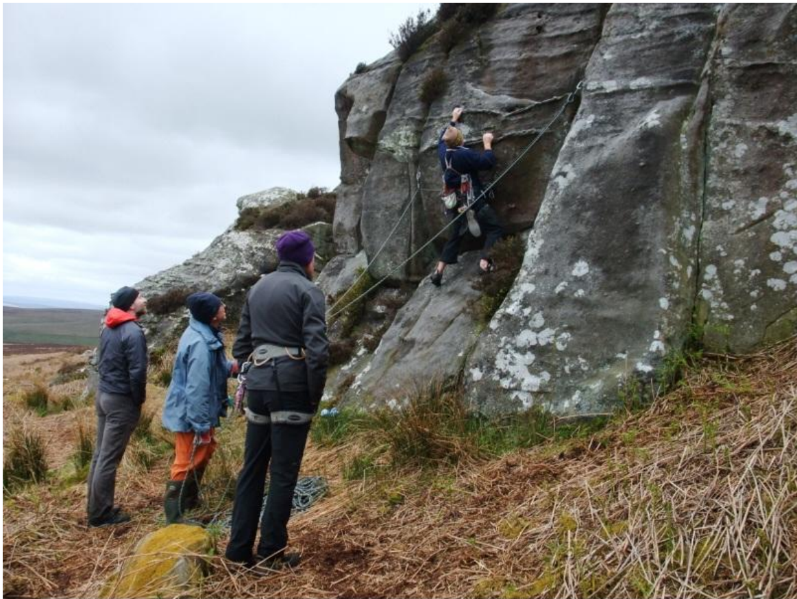
Wet and cold at Callerhues. Meet Leader playing the hero on Thunderclap VS 5a.

Editorial note: It was raining in the morning so the Meet Leader took on the duty of entertaining the party until better times arrived. A breakfast cooking performance, worthy of an Oscar, (involving several changes of frying pan and an advance party being sent out to secure oil supplies) lasted for 55 minutes until the weather began to relent.