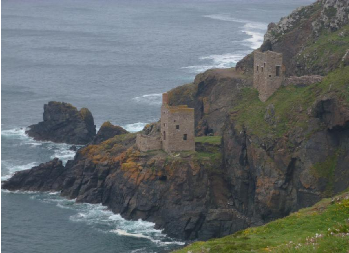
A scene near the campsite