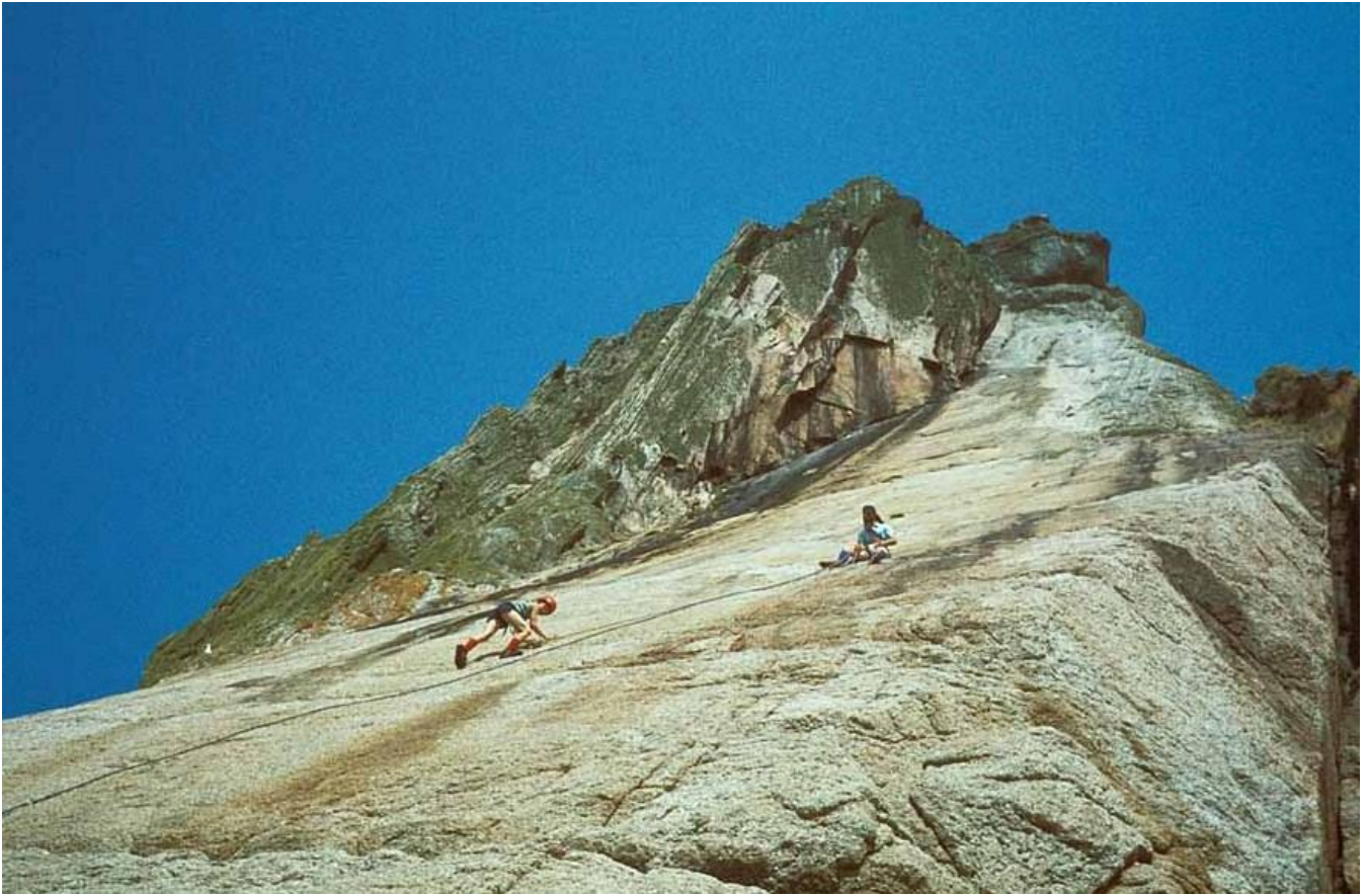
The Devil's Slide and line of Albion - Lundy