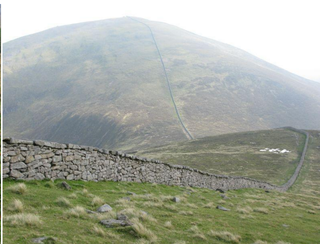
The Mourne Wall.

The trip started with a tension filled drive to East Midlands airport as the M1 ground to a halt. However taking an alternative route and putting my foot down a bit got us there in time. From Belfast International airport we had a 1 ½ hour drive to a hostel in Attical, near Newcastle, not far from the border with the Republic on the east coast. Next morning I took Gill and Kate to the start of the race and watched them set off for 2 days of fun navigating across trackless areas of the Mourne Mountains and an overnight camp. They were fortunate to have excellent weather for the event.