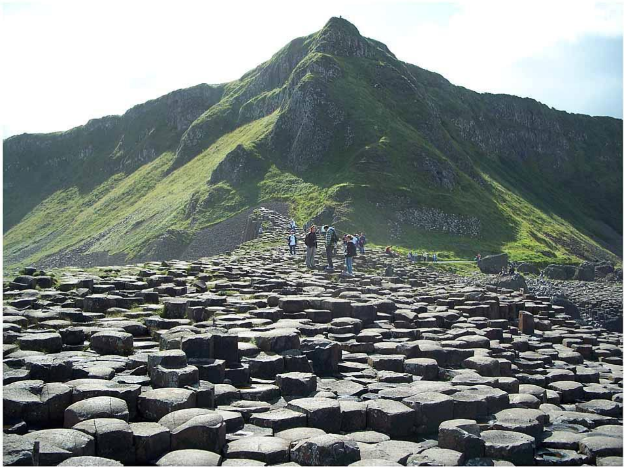
The Giant's Causeway – County Antrim