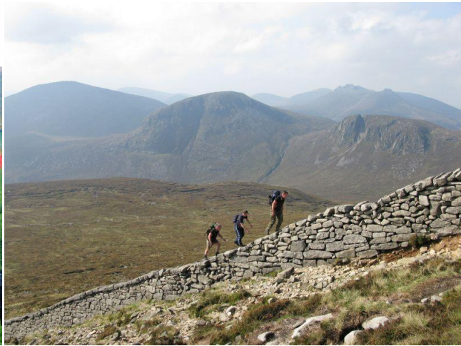
The Mourne Wall Again

Next morning I went back up to the race base in the Annalong valley (now deserted as the first runners were not expected before midday). In brilliant weather I did my own round of the main mountains: Slieve Binnian – Douglas Crag – Slieveamagan – Cove Mountain – Slieve Commedagh – Slieve Donard – Chimney Rock Mountain – Rocky Mountain. A tiring but great day. One of the impressive features of these hills – not unlike the Lake District in many ways – was the Mourne Wall. This impressive feature follows the main ridges and was built over 25 years in the early part of the 20 th century when the area was designated to provide reservoirs to supply Belfast. The wall is up to 15ft high in places and is in good condition. In poor weather it provides a bit of reassurance when navigating on the hills.