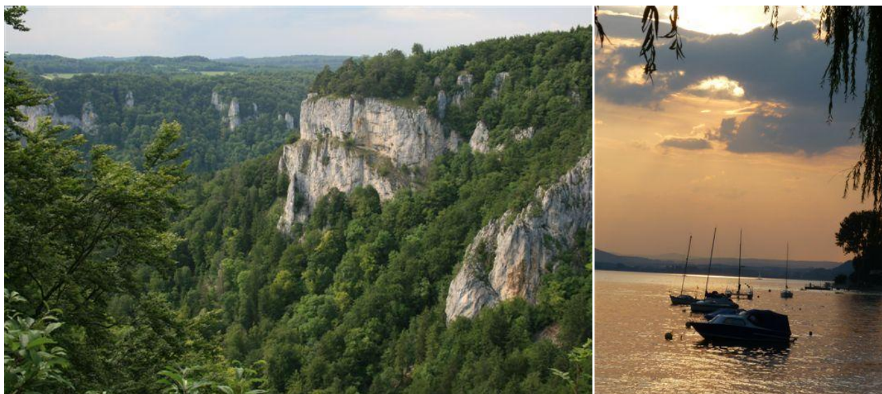
From the Wildenstein Youth Hostel, looking down the Upper Danube Valley -Sunset on Lake Constance

the lake is always on your right hand side and you can jump in for a swim anytime and anywhere, not to mention that the cherry season was in full swing. The area around Lake Constance is one of the biggest wine and fruit growing areas.