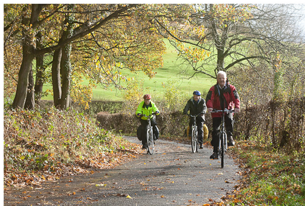
Autumn colours - Oreads cycling on in unexpected sunshine on country lanes just north of Bakewell (near Ballcross Farm)

Seven people assembled at Middleton Top on Saturday Morning in thick mist and a light drizzle. All departing at 10.30 and by the time we reached Longcliffe the weather had already deteriorated into a steady rain. Onwards towards Elton and the café where we were to meet up with J. Ashcroft.