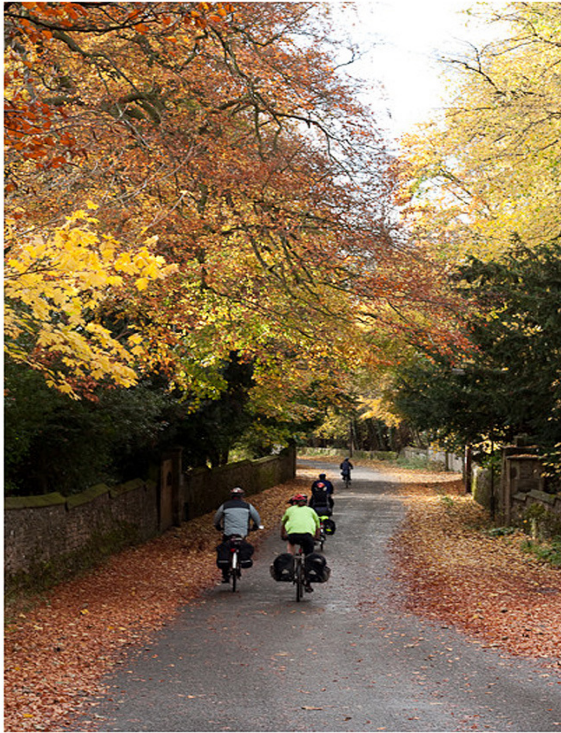
Autumnal cycling on a country lane (Horse Lane) just NW of Monyash