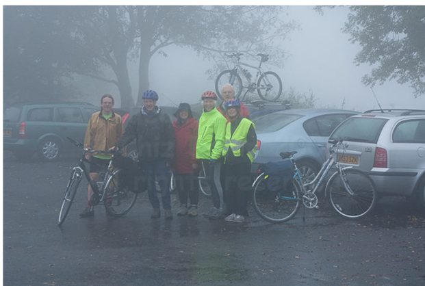
Oreads at the start - Middleton Top Car Park