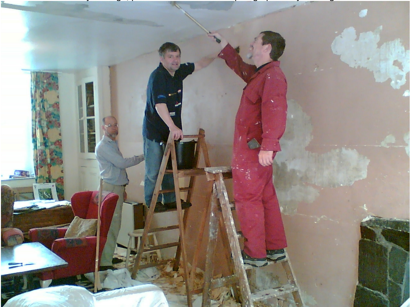
A Motley Crew at the working party last month.

We finally have a meet set for the Alps this summer and there is an awful lot going on at both huts, more news as I get it. Remember, next months newsletter will be a double, to include August. Please let me have your write ups in good time. I still want to hear from those of you lucky enough to have been to far away places, to give the rest of us some good idea's for destinations to climb. It does not matter if it was a few years ago, please let me have a few paragraphs for your magazine.