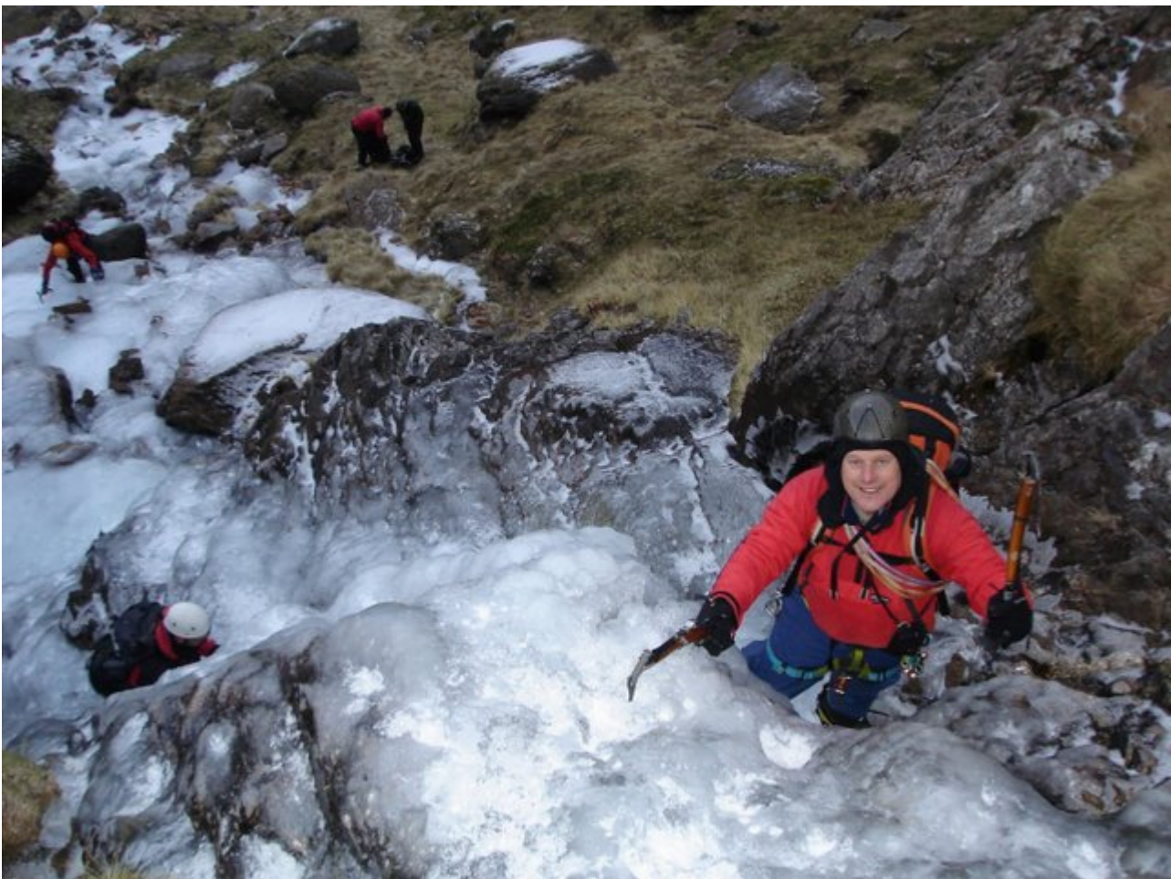
Parsley Fern Gully 2009