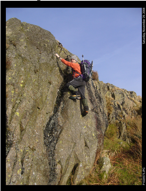
P1020573.JPG Saturday, November 29, 2008