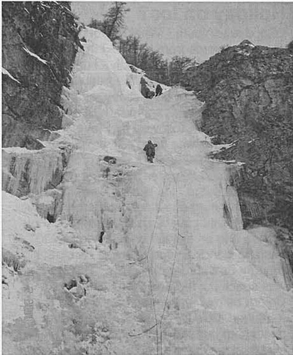
'La Colère du ciel': La Grave

length, same grade 250m II/3+ and the same straightforward walk off the back. Throughout the day, under clear blue skies, we looked down on the bright clean sunlit ski slopes on the opposite side of the valley. It really is like Scotland isn't it?